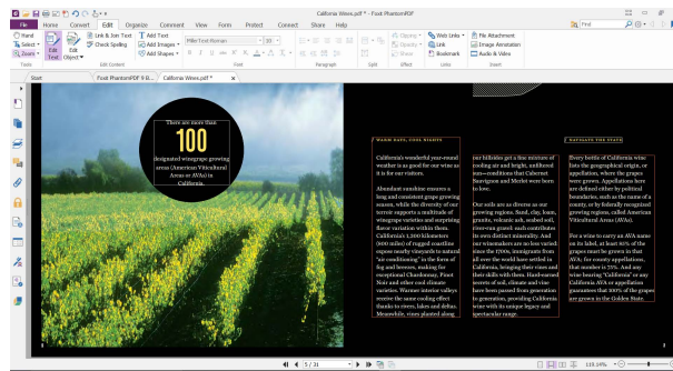
Edit content and layout like a word processor